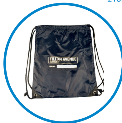
SCHOOL PE BAG £4.50