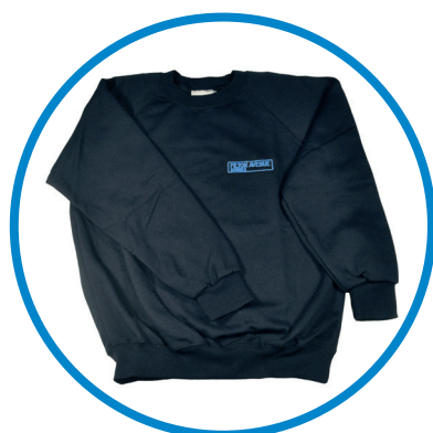
SWEAT SHIRT £9.45

Please remember to order in good time for the new school term, as our school uniform supplier gets very busy over the summer months and it may take several weeks to supply your order.