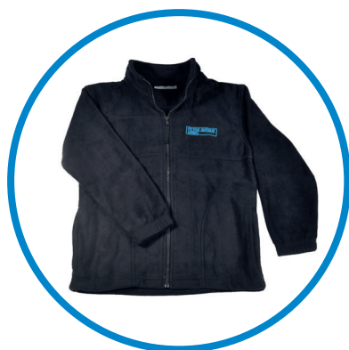
FLEECE JACKET £13.95