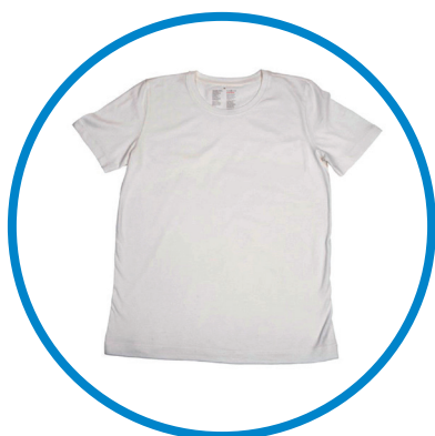
WHITE TEE SHIRT