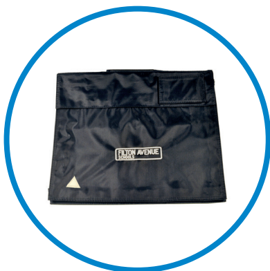
SCHOOL BOOK BAG YEARS R TO 2 £5.50 YEARS 3 TO 6 £6.95