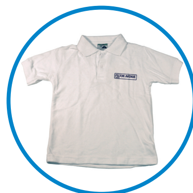
POLO SHIRT £8.00