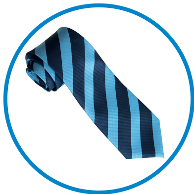
SCHOOL TIE (YEAR 5 & 6 ONLY) £4.00