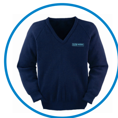
V NECK JUMPER (YEAR 5 & 6 ONLY) £16.95 – £18.50