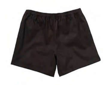
Black Shorts widely available