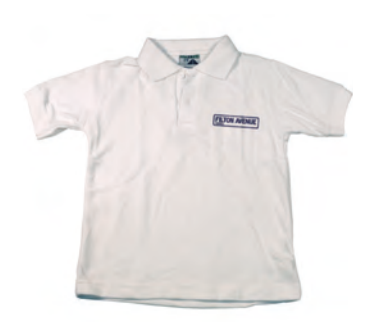
Polo Shirt £8.00