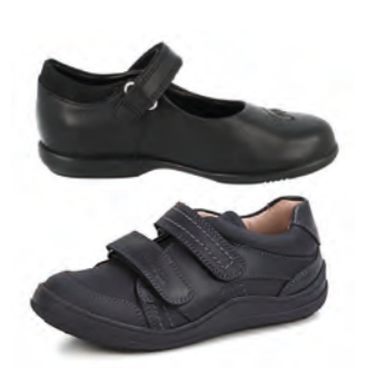
Black Shoes widely available