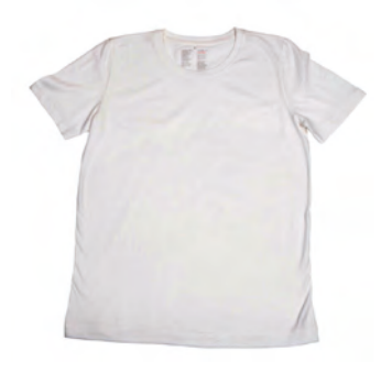
White T-Shirt widely available