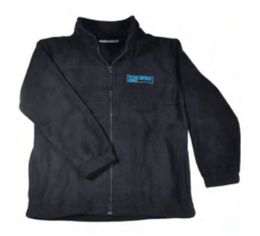
Fleece Jacket £13.25