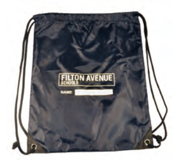
PE Bag £4.50