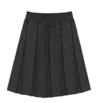
Black Skirt widely available