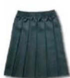
Skirt - black widely available