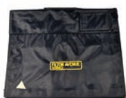
School book bag Infant £4.85 Junior £5.95

Reception children also need to bring in Wellington boots, in a labelled bag, as these will be required all year round.