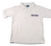
Polo shirt £7.65