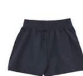
shorts - black widely available