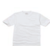
t shirt - white widely available