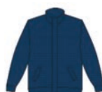
Reversible fleece £15.00