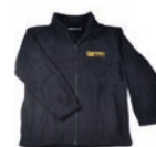
Fleece jacket £12.15